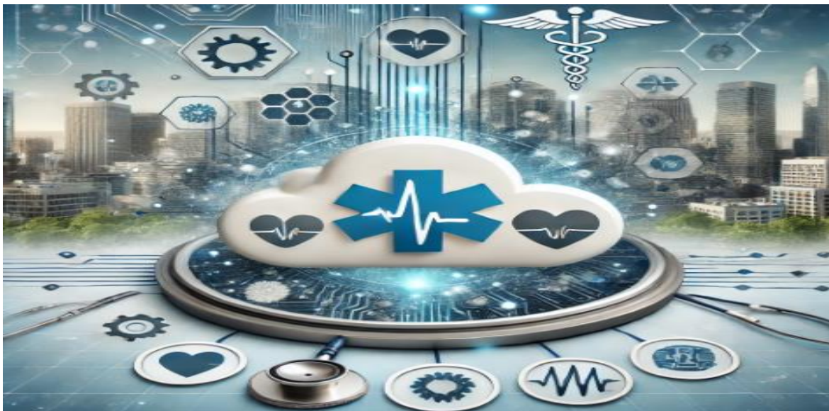
Figure 2 Data privacy

One of the foremost challenges in the healthcare sector is adhering to stringent regulatory requirements. In the United States, the Health Insurance Portability and Accountability Act (HIPAA) mandates that healthcare organizations safeguard patient information and ensure that data is used responsibly. Similarly, the General Data Protection Regulation (GDPR) in the European Union sets rigorous standards for data protection and privacy.